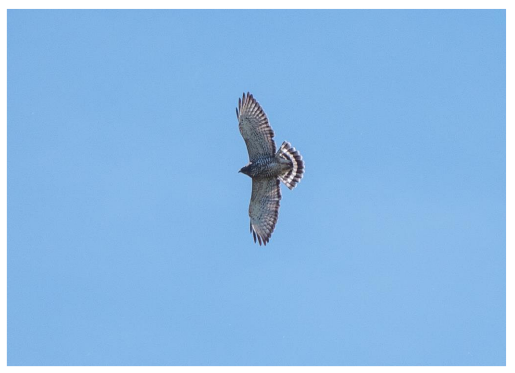
Broad-winged Hawk over west side Glenn Valley on September 7, 2020.