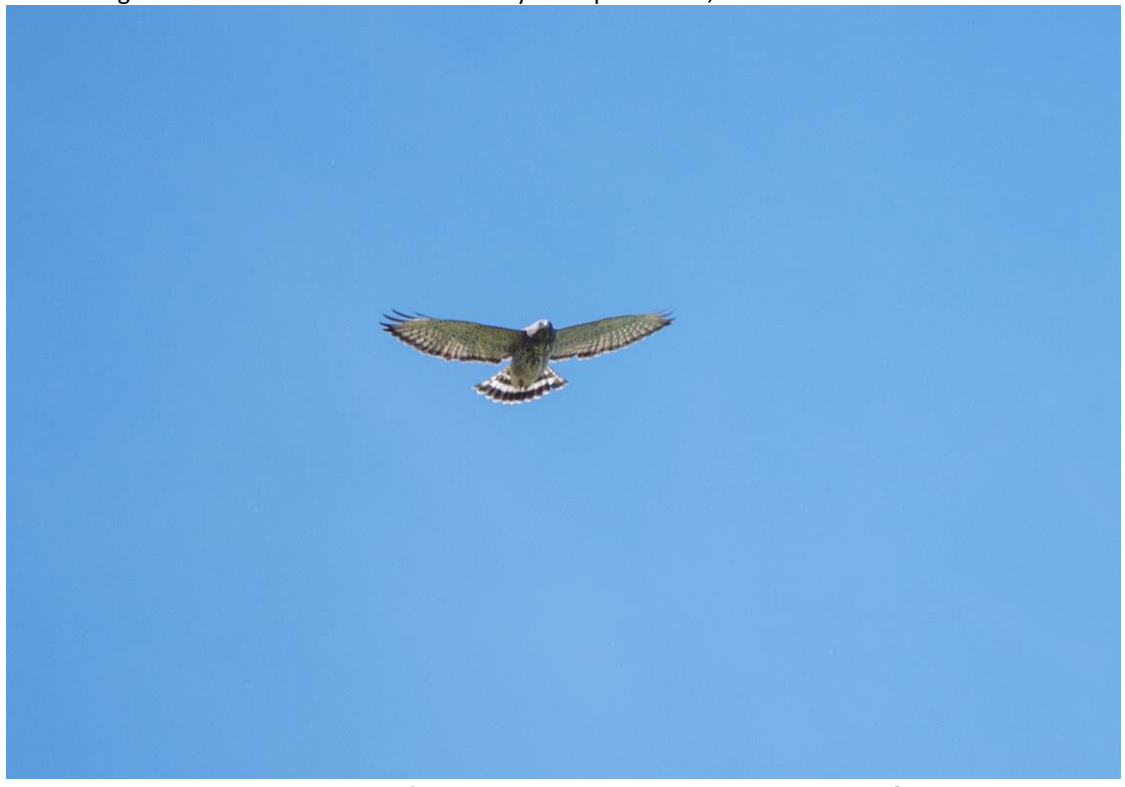
Broad-winged Hawk over west side of Glenn Valley on September 7, 2020.