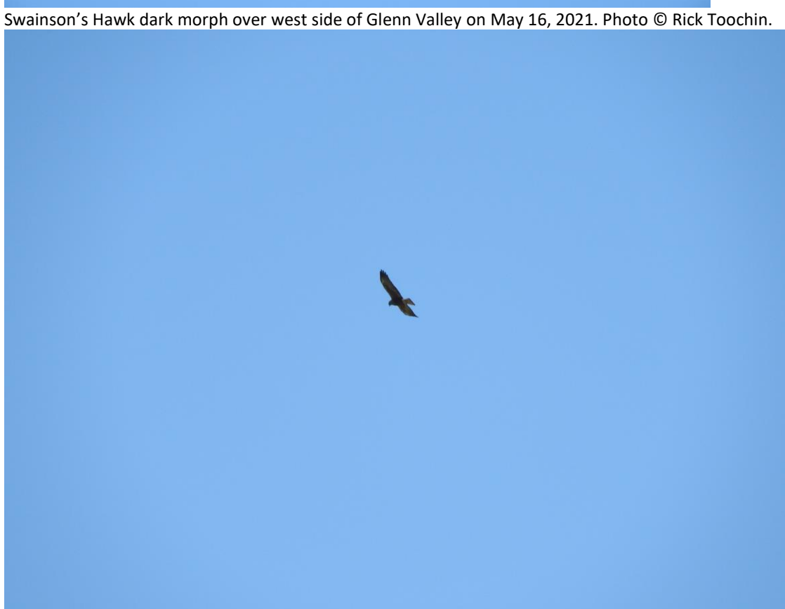
Swainson's Hawk dark morph over west side of Glenn Valley on May 16, 2021.